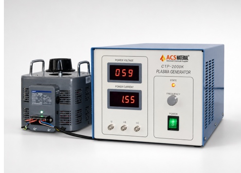
Photo of Low-temperature Plasma Experimental Power Supply

Rated output current: 4A | Number of phases: 1 | Weight: 6.5kg | Insulation heat class: F