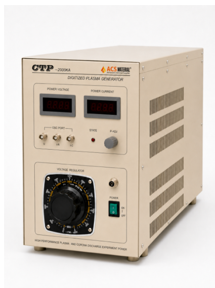
Photo of High Power Low-temperature Plasma Experimental Power Supply