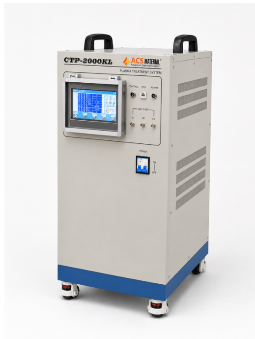
Photo of a CTP-2000KL Equipment

High-Voltage Low-Frequency Digital Plasma Power Supply is a DBD (Dielectric Barrier Discharge) treatment device, designed to support various types of DBD discharge electrodes. The high-voltage electrode of the DBD electrode to be used should be connected to the high-voltage interface of this equipment, while the low-voltage electrode should be connected to the low-voltage interface. After turning on the power via the circuit breaker, the voltage, current, power, frequency, and other parameters can be adjusted via the touchscreen to generate an ionized layer in the electrode. The external interface allows for voltage waveform monitoring, instantaneous current detection, and integrated current detection.