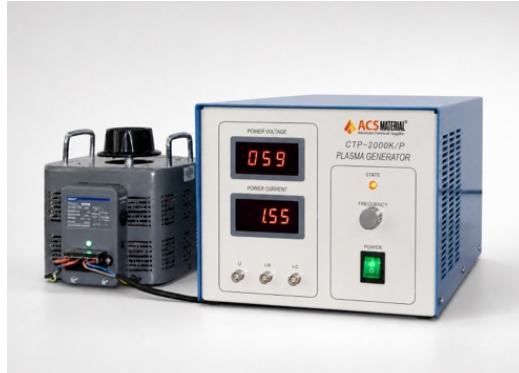
Photo of Modulated Pulse Low-temperature Plasma Experimental Power Supply

Frequency adjustment range: 1Hz ~ 1000Hz. Duty cycle adjustment: 1% to 99%.