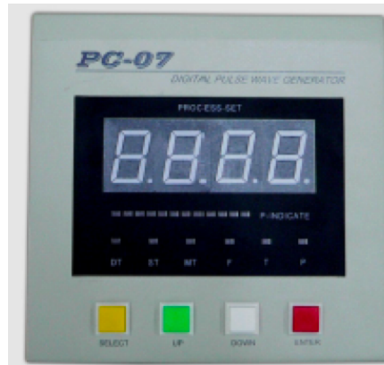
Photo of Digital Pulse Modulator Panel